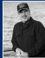
Captain Richard Phillips

Additionally, be sure to gear up with all the Camp Miakonda 100th Anniversary memorabilia, with new items available in the Scout Shop and Camp Trading Post: patches, silver coins, knives, mugs, and more!