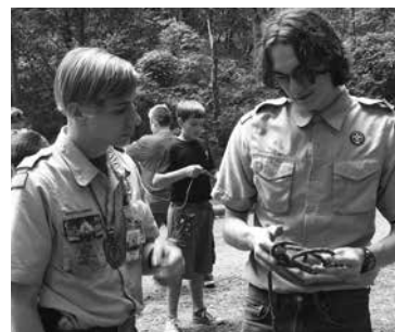
Scouts learning together at the 100th Anniversary of Camp Miakonda on August 12, 2017.